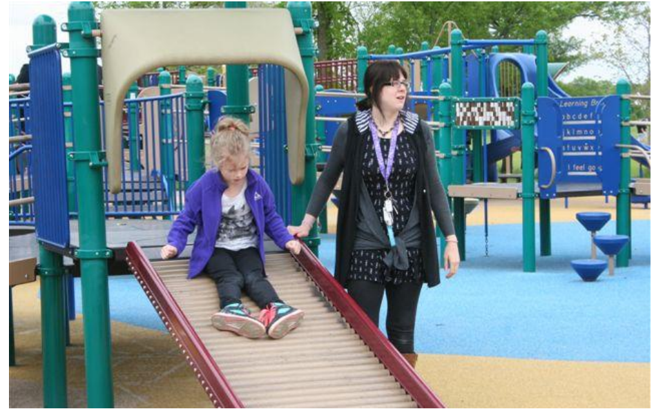
Students enjoyed the Newark Rotary Playground during our meeting.

Next week: Meeting will be back at the DoubleTree and the program will be from 'The Weathervane Playhouse' announcing the new season.