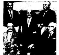
Rotarians Taken Back 55 Years